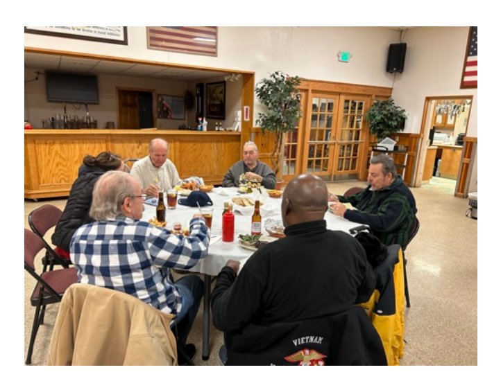
Veterans from Eden Heights enjoying dinner at Post 880.