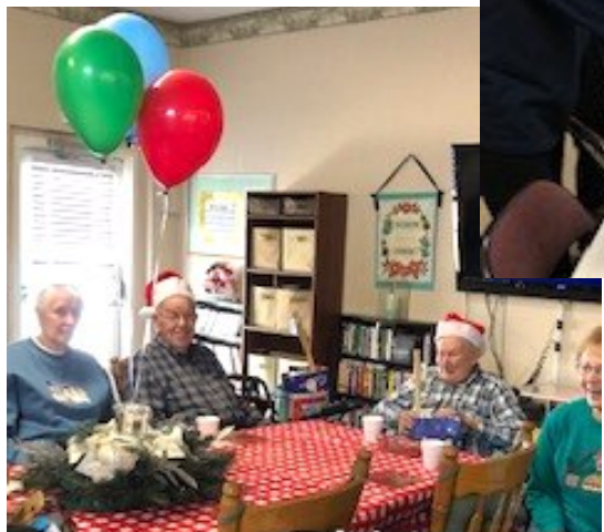
Auxiliary members are filling gift bags for the veteran residents at Eden Heights. Items included Avon products, snacks, candy, a back scratcher and a Santa hat!