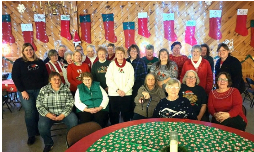
Auxiliary members enjoyed an evening of food and fun at our annual Christmas dinner that took place on December 16. A great time was had by all.