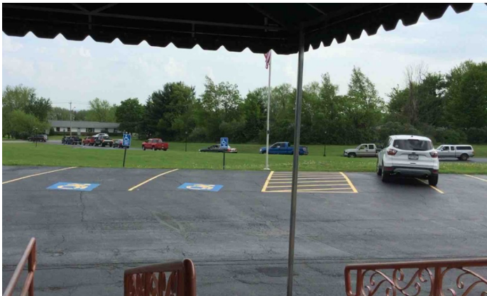
Above: Police escort procession at Eden Heights Assisted Living Center on Memorial Day