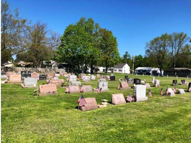
Eden Evergreen Cemetery decorated with flags