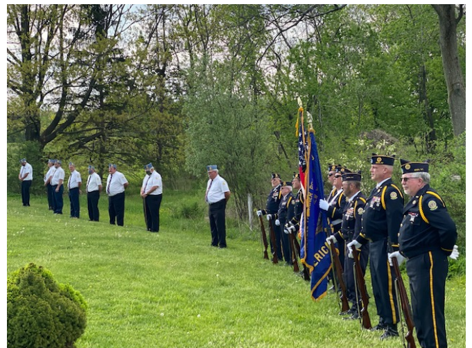
Right: Post 880 Honor Guard and SAL at St. Mary's Cemetery on Memorial Day