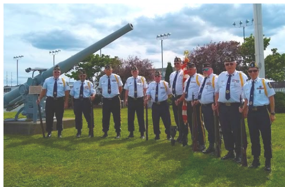
Post 880 Honor Guard at the Veterans Day Service at the Erie County Fair August 15th